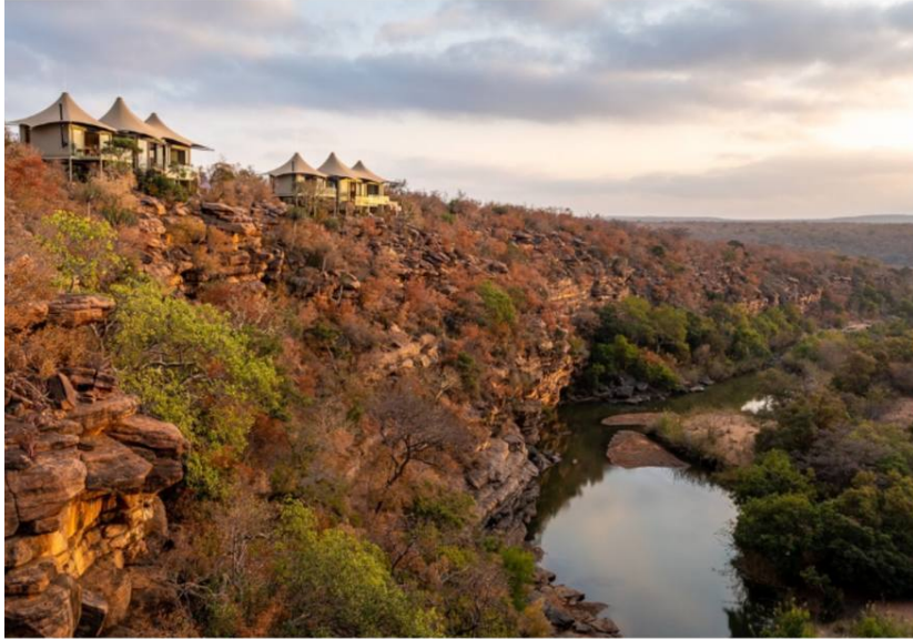
jo is one of Africa's few not-for-profit safari lodges.

ed more than 300km from Johannesburg, and consisting of just five private villas, is Camp by Lepogo Lodges, one of Africa's few entirely not-for-profit high-end safari s.