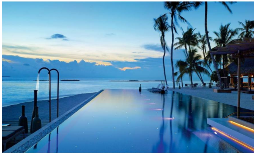
Have an entire Maldivian island to yourself with Velaa's island buyout.

If you're looking to holiday in isolation once international travel resumes fully, check out these spots