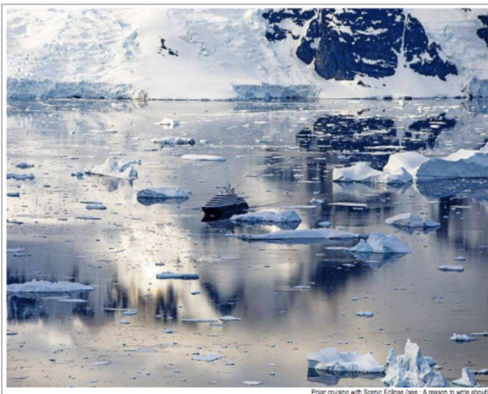
Polar cruising with Scenic Eclipse (see : A reason to write about)