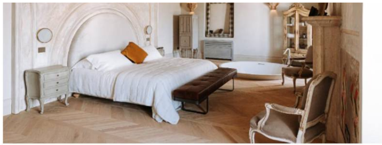
Paragon700 GREGORY VENERE