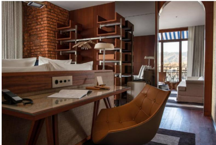
La Réserve Eden au Lac Zurich LA RÉSERVE

Puglia is one of the buzziest destinations for 2020, and with charming new outfits popping up like Paragon700 , there really is no better time to visit. Timelessly elegant and dripping with a sense of history, this lovingly restored former palace is located at heart of Ostuni. Each of the 11 rooms has its own unique design and sense of character.