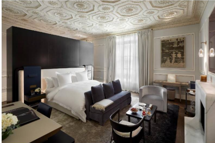
Hôtel Particulier Villeroy's Suite Lescot HÔTEL PARTICULIER VILLEROY