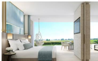
Ikos Andalusia in Spain