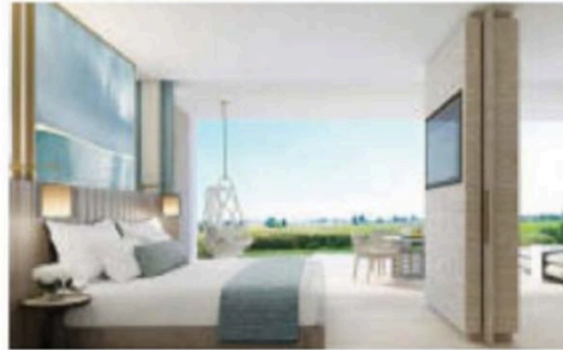
Ikos Andalusia in Spain