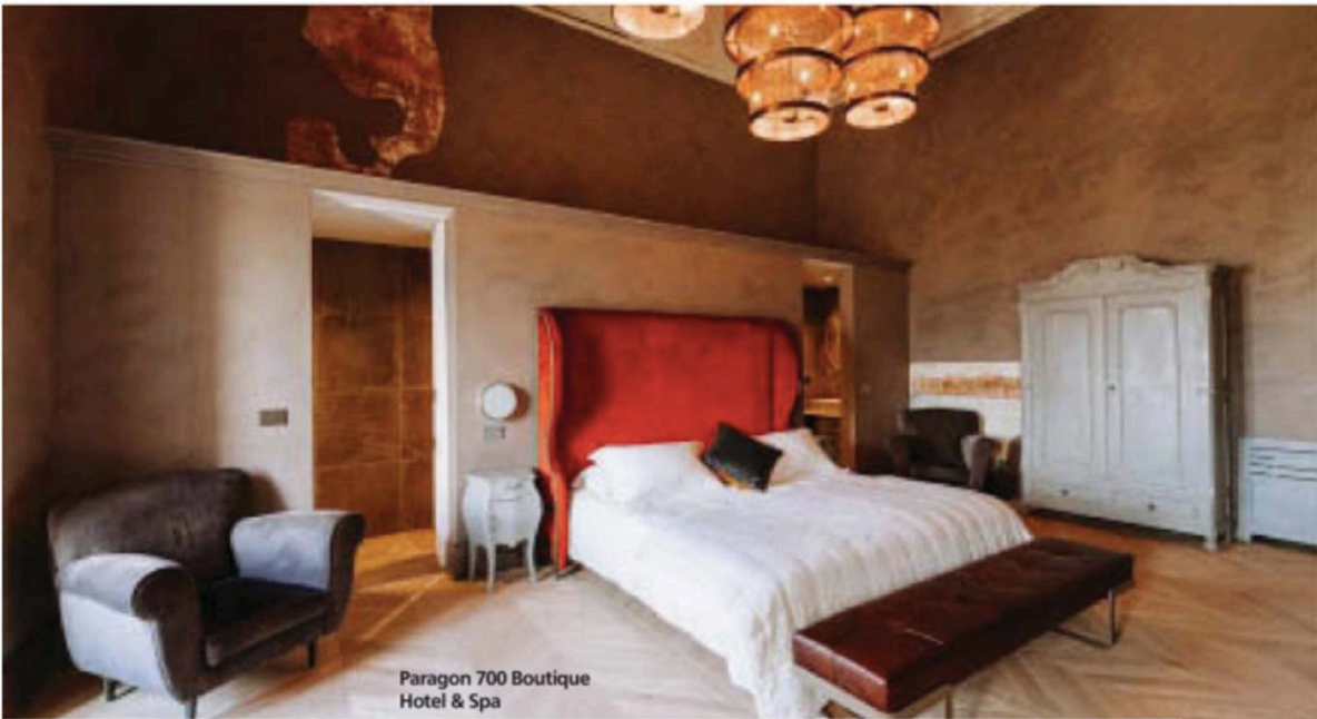
Paragon 700 Boutique Hotel & Spa