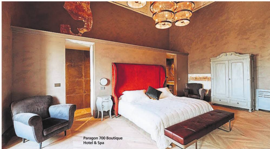
Paragon 700 Boutique Hotel & Spa

Paragon 700 Boutique Hotel & Spa, the elegantly restored red palace in the heart of Puglia's White City Ostuni, is set to open in Summer 2020. This quintessentially Puglian property is being meticulously restored to boast 11 individually curated rooms and suites with a cosmopolitan soul. Standing in stark contrast to the whitewashed buildings of Ostuni, Paragon 700's red brick facade cocoons a lush garden and swimming pool, a rare green space in the heart of the city, offering a tranquil and exclusive oasis, just a five-minute walk from Ostuni's main square. This new hotel will offer gourmet meals