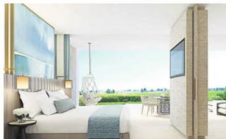
Ikos Andalusia in Spain